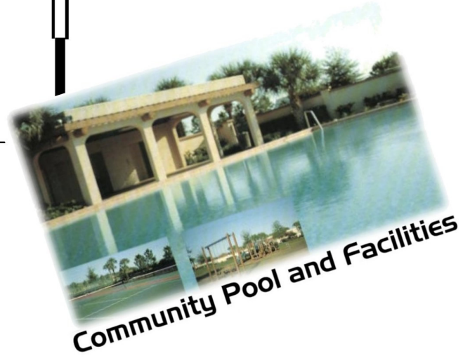
Community Pool and Facilities